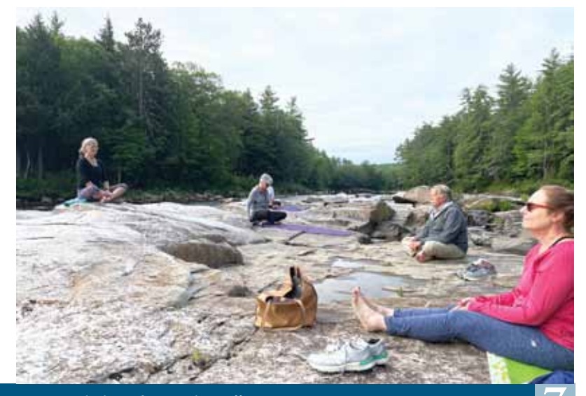
"Find your place on the planet. Dig in, and take responsibility from there."